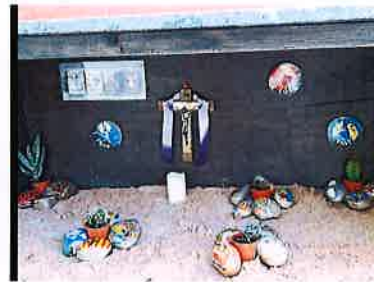
Our Prayer Space

During Lent, the priest wears purple. This is a sign that we are sorry and we want to change so we are more like Jesus. Our classroom focal points are also purple during Lent to remind us of this special time.